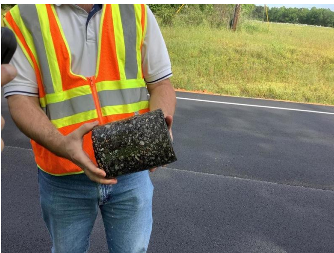
Core Cut showing tack bonded Pavement Layers