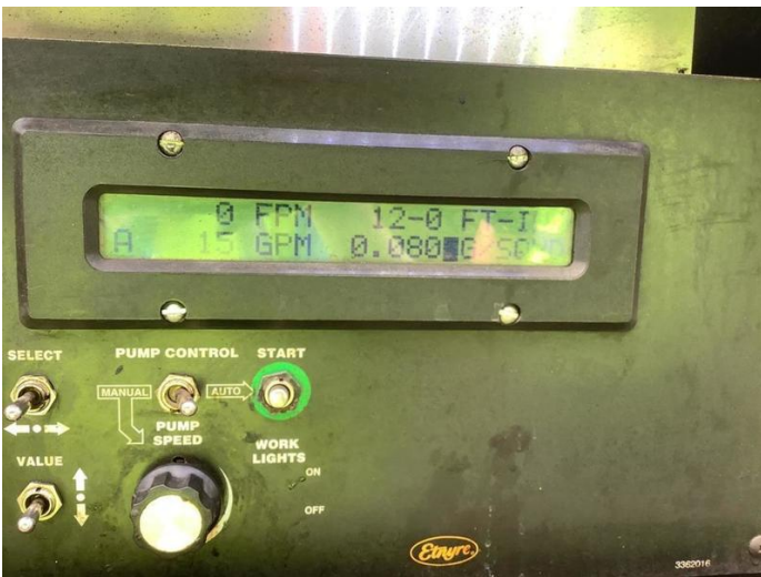
Shot Rate on Distributor Computer 0.08gal/sy