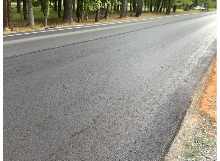
Broken Tack (Uniform Coverage)