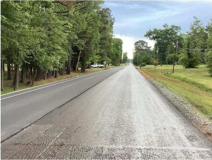
Uniform Shot Rate (Not Broken)