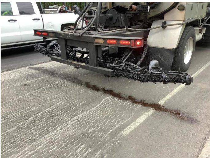
Prior to shooting trackless tack and checking each nozzle.