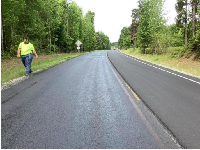
Perfect Uniform Coverage of Broken Trackless Tack