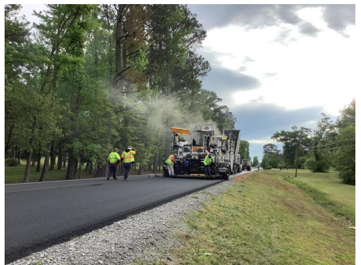
Paving Hot Mix