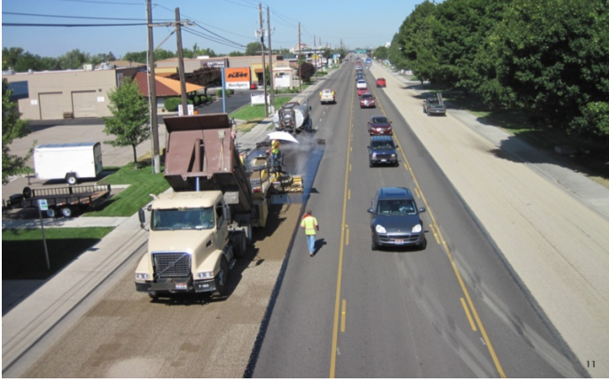
Chip Seal Process