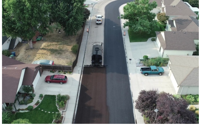
Fog Seal Process